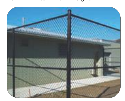
The zebra pens were fabricated from black vinyl coated chain link on vinyl coated framework with top and mid rail. Below is the slide gate through which zebras and rhinos pass.

Specially-constructed slide gates are fitted to the interior holding pens of the giraffe night house. There are three total, and they are 15-ft. tall with 3-ft. openings, mounted on overhead tracks. A special stainless steel pull rod was attached to each gate to allow the keeper to open it from a secure area. The giraffe pens were built from chain link ranging from 42-in. to 17-ft. in height.